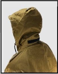
Stow a way Hood