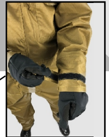
Sleeve Tab Adjustment with inner elastic cuff