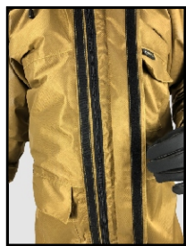
Sewn using TENARA Gore Sewing Thread