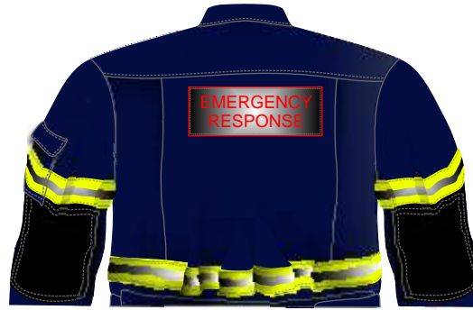
REFLECTIVE SEW ON PANEL