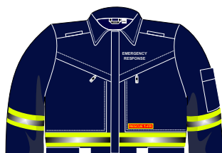
Reflective heat transferred panel

We can supply your customised panels with your exact wording requirements as per the examples below.